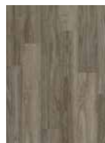
710 Spotted Gum Ash