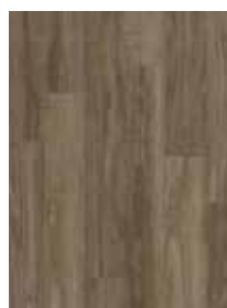
540 Spotted Gum Riverbank