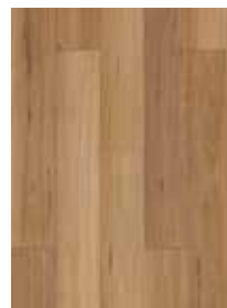
535 Blackbutt Elegant