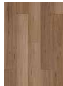
545 Blackbutt Classic