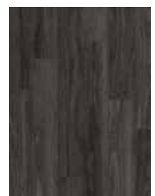
790 Spotted Gum Burnt