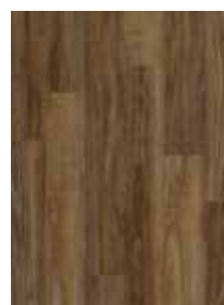
555 Spotted Gum Natural