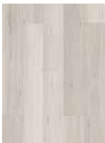
105 Blackbutt Ivory