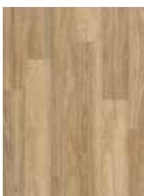
520 Spotted Gum Blonde