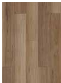
525 Blackbutt Sandbank