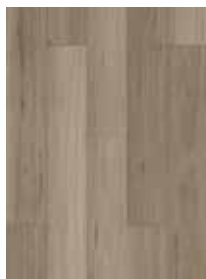
505 Blackbutt Limed