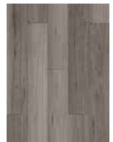
735 Blackbutt Stormy